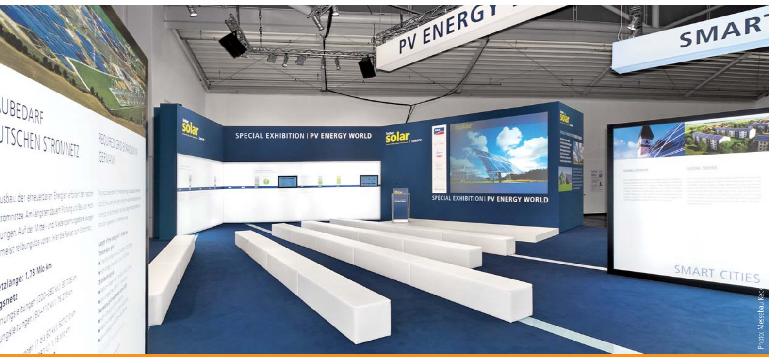
PHOTO: High-value booth construction for the display of sponsor logos at the presentation area of PV ENERGY WORLD.