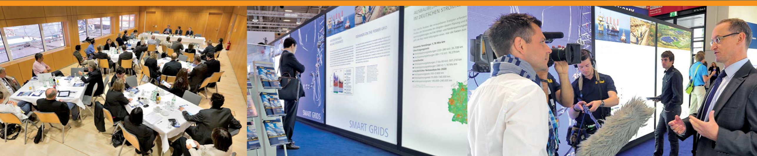
PHOTOS: 1 Background information about PV ENERGY WORLD for trade journalists. 2 The highly informative PV ENERGY WORLD magazine is distributed free of charge to the visitors.