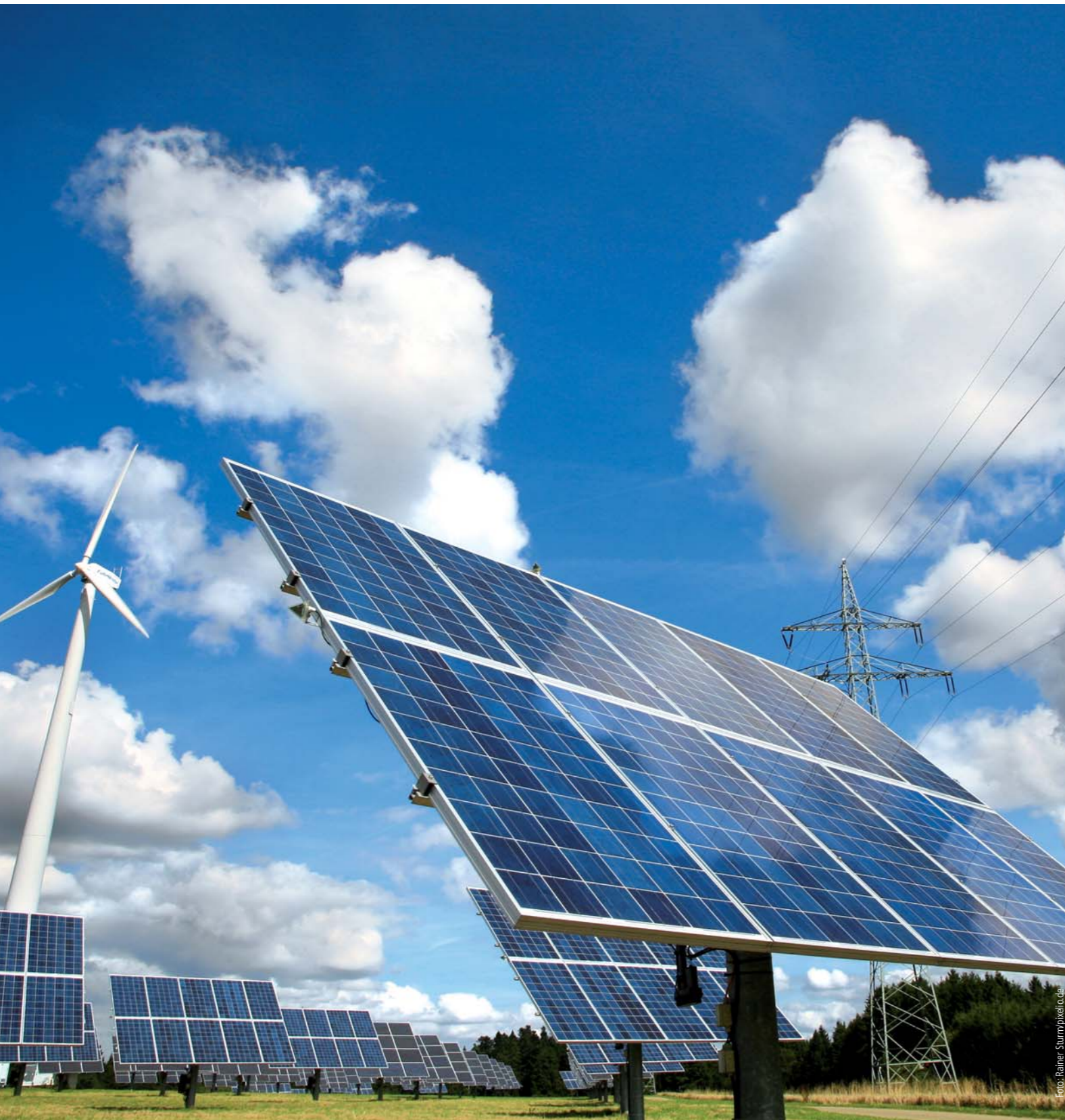
PHOTO: Today, approximately 17% of Germany's electricity demands are met by around a million solar, wind, and hydropower installations as well as biogas combined heat and power (CHP) plants.